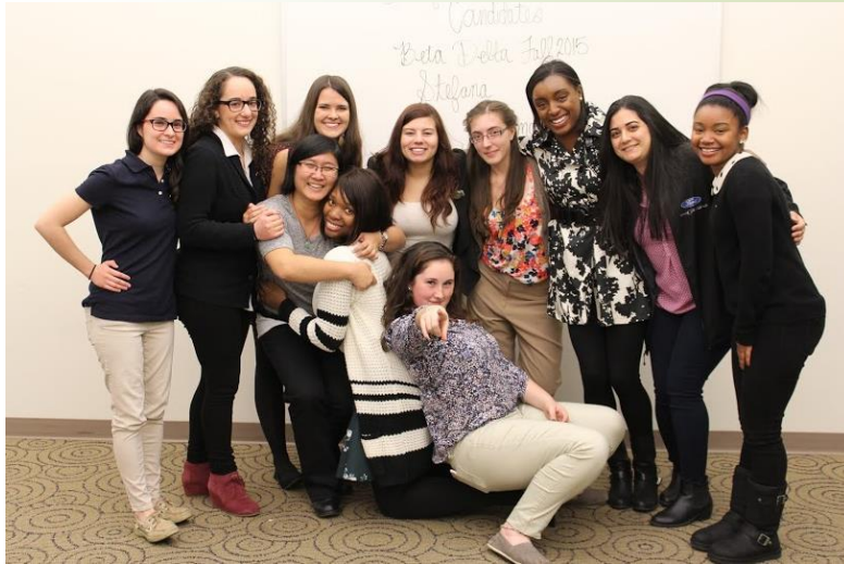
Some of the sisters after candidate initiation this past semester

Feb. 23 rd – Celebrate Engineering Day Mar. 31 st – Rock painting Apr. 1 st – Chapter Founder’s Day